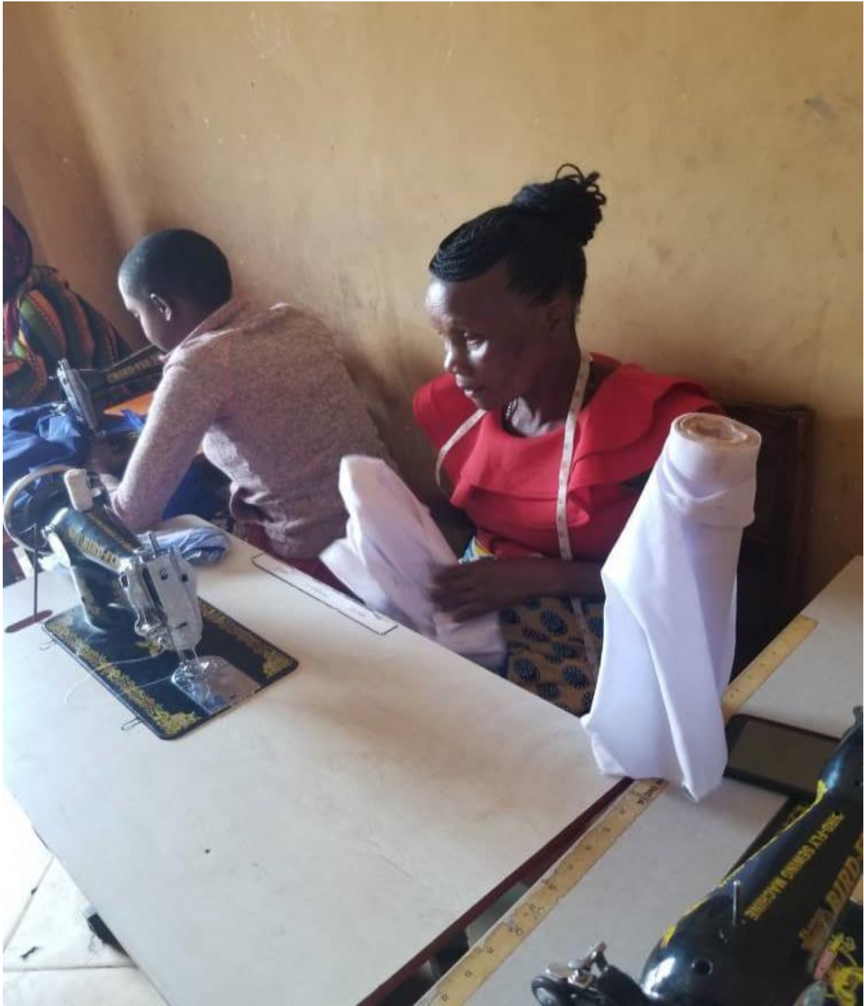
Figure 1.8 Proceedings of the sewing activities in the training centre.