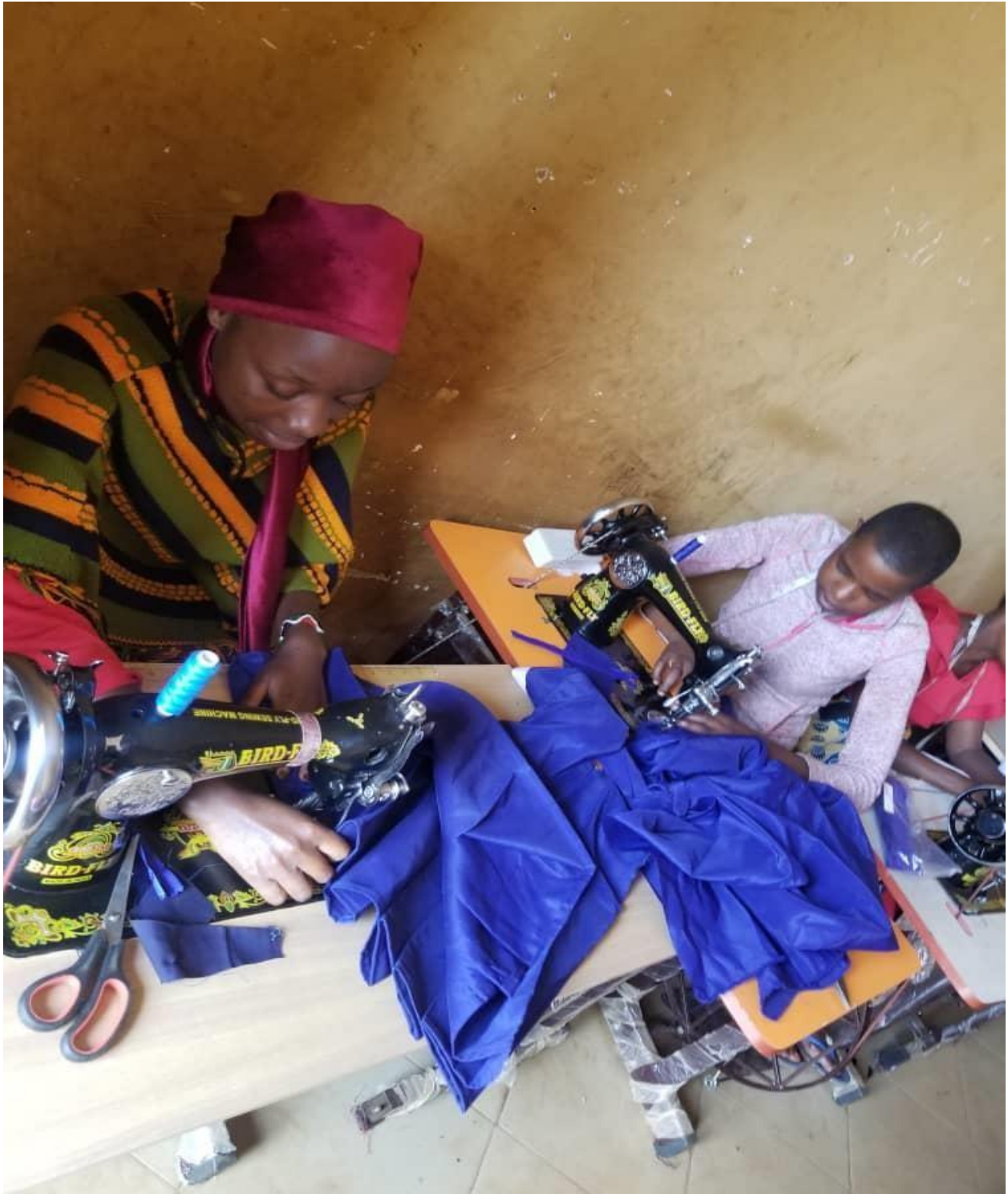
Figure 1.9: Process of the activities of sewing a school uniform